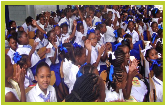
Nelson Street Boys R.C (top) and Nelson Street Girls R.C (bottom) Schools